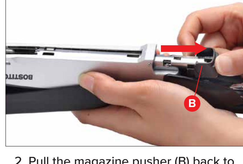
2. Pull the magazine pusher (B) back to expose the staple channel.