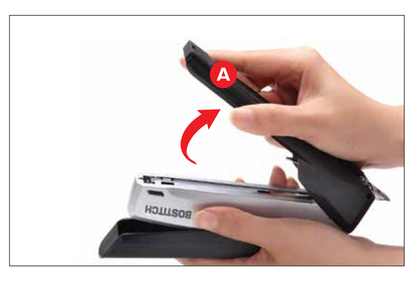
1. Flip the stapler upside down and open the base (A) away from the body.